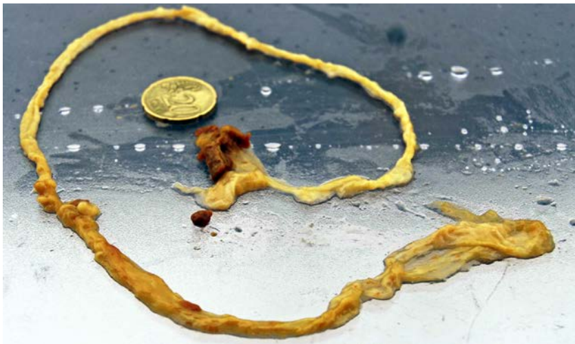
Fig. 32: Photograph of biofilm eliminated from a human intestine

Since the brands of these antiparasitic drugs differ across countries, we will use the name of the primary active chemical substance in this protocol. You should ask your pharmacist about the brand.